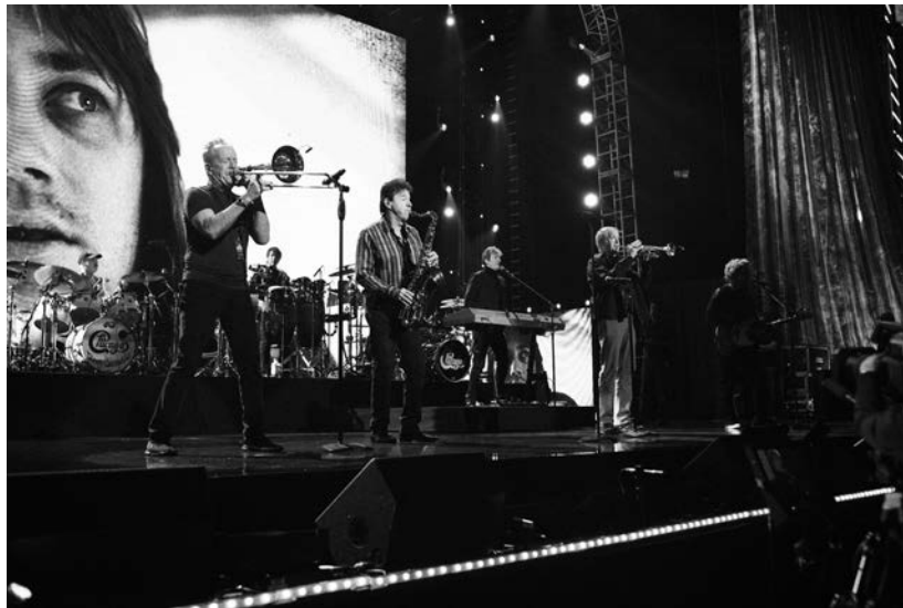
Chicago was inducted into the 2016 Rock and Roll Hall of Fame. This was their first nomination. They’ve been eligible since 1994. A long time coming! Photo of late band member Terry Kath appears on the screen behind the band. The original band members who were at the ceremony were Robert Lamm, Lee Loughnane, Jimmy Pankow, Walt Parazaider, and Danny Seraphine. Peter Cetera was not there.

Listen to your playing; listen to your section’s playing; listen to the full band’s playing. Are you in sync? Are you in tune? Are you blending? Are you articulating together? Are your attacks and releases together? Is your phrasing together? Are your dynamic changes together, or contrasting, as the music calls for? And, of course, listen to the director. That’s the key to making great music together: You MUST listen, play with passion and have fun.