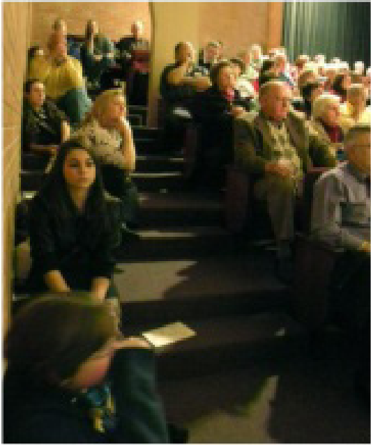
People sitting on the steps of the balcony!

later told me he could see less than twenty empty seats on the floor, and maybe three in the balcony.