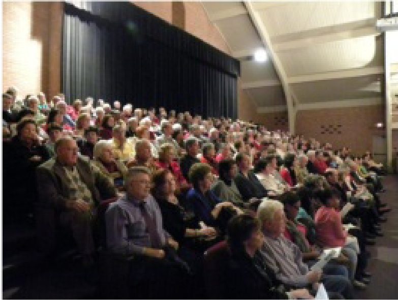
This is a picture of the balcony at the beginning of the concert. It got even MORE crowded as the concert got under way!

We play almost all of our concerts in the Belhaven University Center for the Arts Concert Hall, a former Methodist church converted to the university's use, in their 800 seat auditorium.